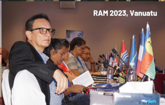
RAM 2023, Vanuatu

We wish you and your families a Merry Christmas and a Prosperous New Year