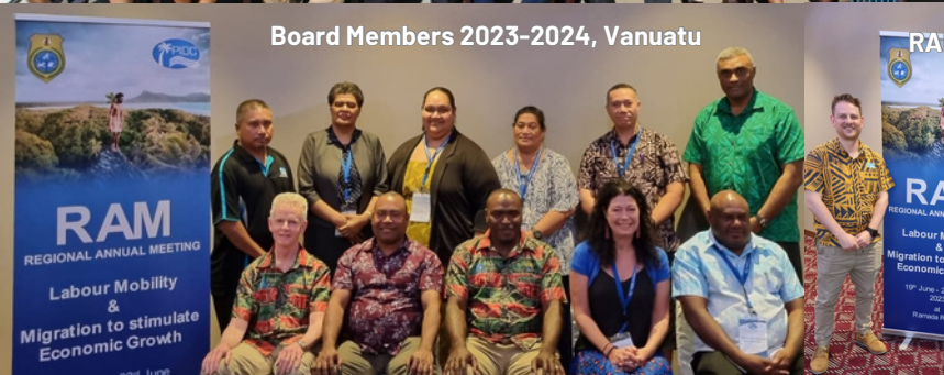
Board Members 2023-2024, Vanuatu