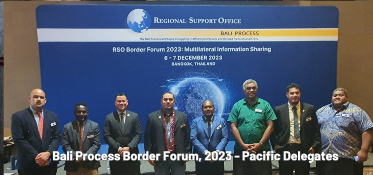
Bali Process Border Forum, 2023 - Pacific Delegates