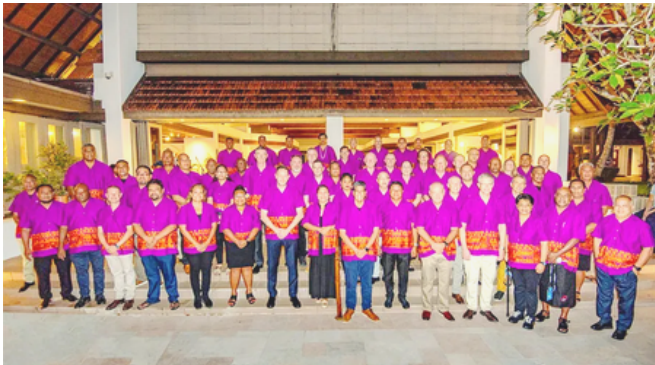
Participants of the Joint Heads of Pacific Security in Palau.

Law enforcement, national security, and military leaders, including police, customs, and immigration from across the Pacific, met in Koror, Palau, for the fifth annual Joint Heads of Pacific Security (JHoPS) Meeting from 23-24 August 2023.