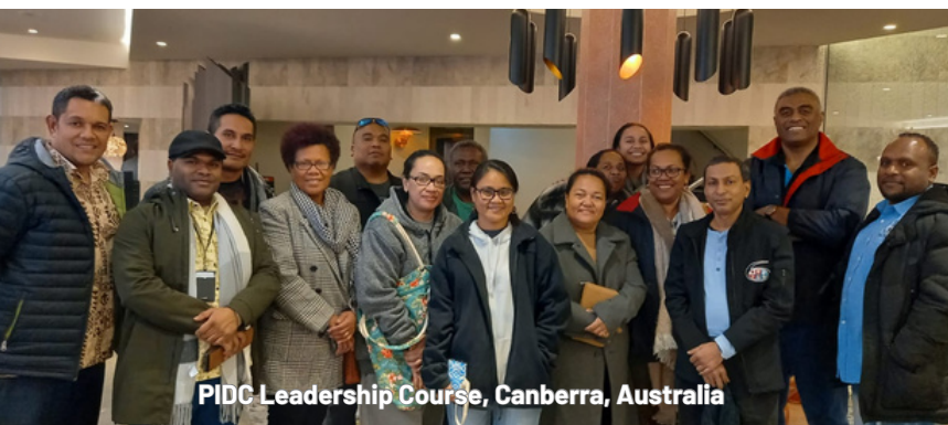
PIDC Leadership Course, Canberra, Australia