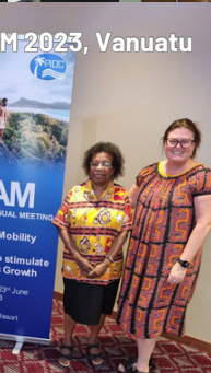
RAM 2023, Vanuatu