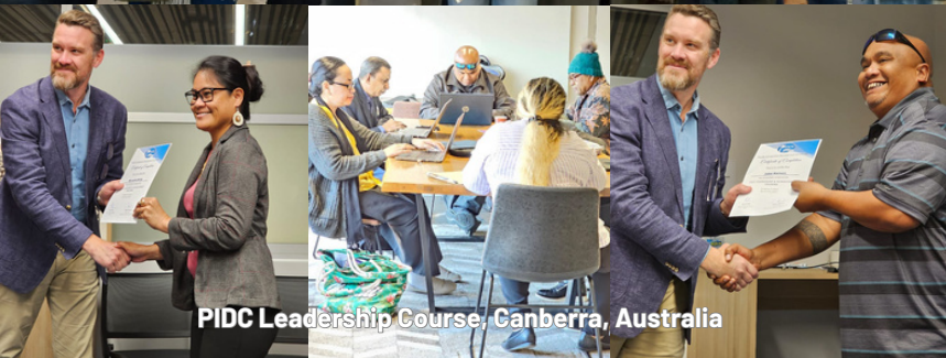
PIDC Leadership Course, Canberra, Australia