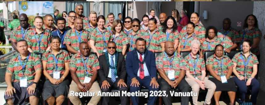
Regular Annual Meeting 2023, Vanuatu