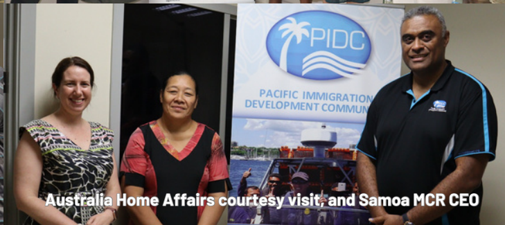
Australia Home Affairs courtesy visit, and Samoa MCR CEO