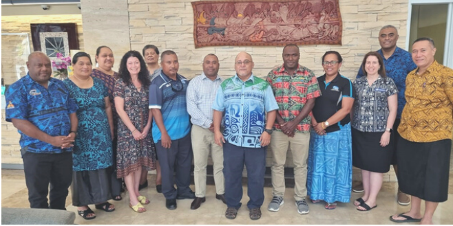
Board Members in Palau.

Palau Immigration hosted the Immigration Directors from the 25th and 26th of October 2023, as PIDC Board members held its 54th meeting at Koror. This meeting is also the first of the Board's round of meetings for this financial year. The meeting was well attended by members comprising of Immigration chiefs and directors from Vanuatu as chairperson, Solomon Islands and Papua New Guinea as Vice Chair, Tonga as the representative of Polynesia, Fiji for the Melanesian group, Tuvalu for small island states and of course the host nation Palau for Micronesia. The meeting was also attended by the PIDC Secretariat Principal Donors, Australia and New Zealand. Samoa as the host country for the PIDC Secretariat also attended.